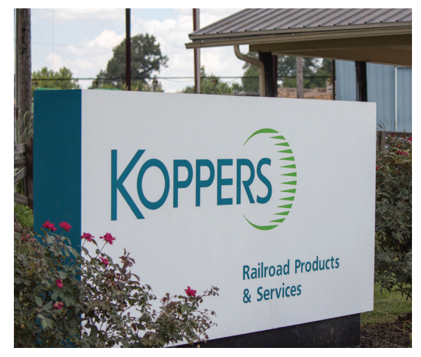
Koppers was a gracious host for the Tie Grading Seminar.