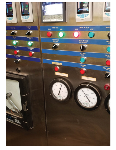
Plant automation has greatly improved quality control.