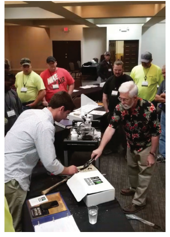
The class gathers around to see how far the dye penetrated each species.