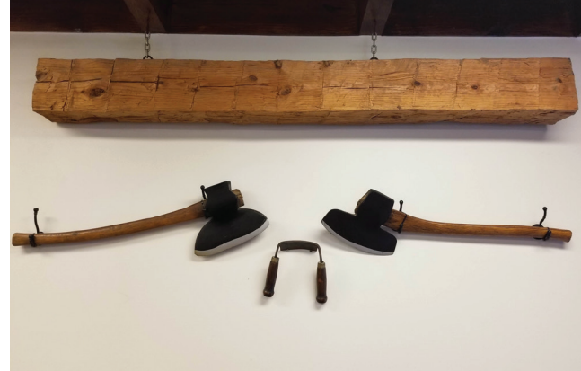
A bit of history hangs at the Koppers Guthrie plant. A hand-hewn tie with Broad Axes and other tools of the trade.